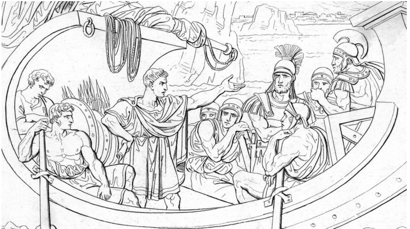
Julius Caesar, captured by pirates, gives them imperious commands in this drawing from 1820. Image by: Bettmann/Getty Images

Editor's Note: The Mediterranean has always seen a flourishing of cultural exchange and trade. A few thousand years ago, Greek and Phoenician merchants sailed the coasts of Turkey, Syria, northern Africa and Europe, setting up colonies along the way. Pirates inevitably saw these merchant ships as ripe pickings.