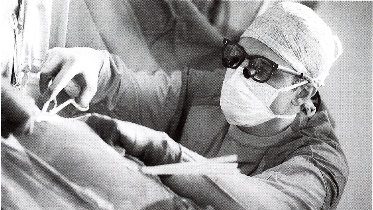
A heart surgeon operates.

A 9-month-old baby lies on an operating table. His eyelids are taped shut and a breathing tube has been put into his nose. A line has been drawn on his chest to show the surgeon where to make the cut. Nurses paint his body with antiseptic to protect the baby from infection.